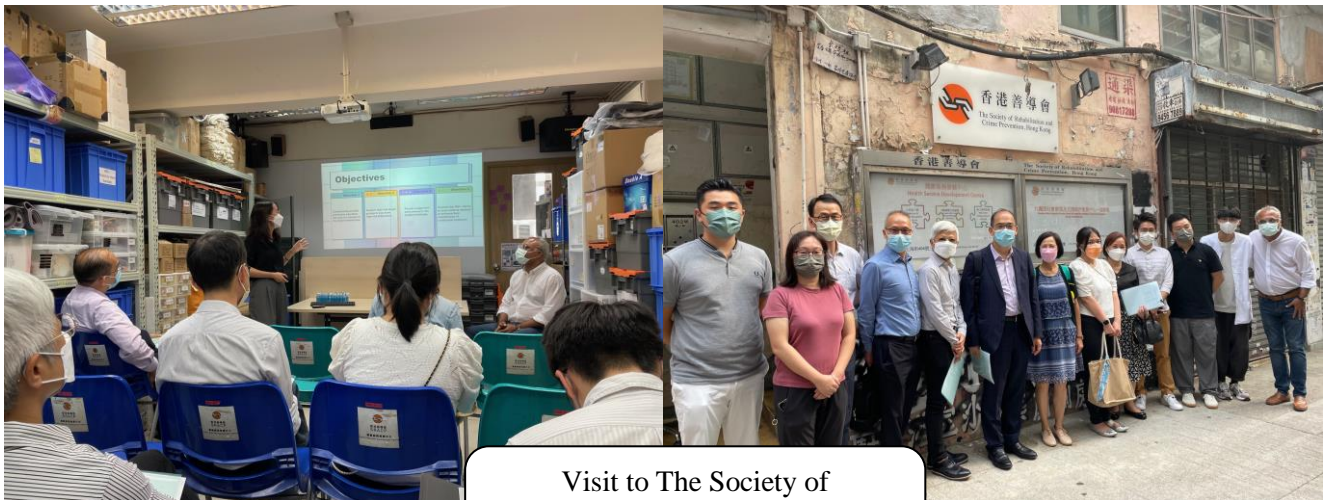
Visit to The Society of Rehabilitation and Crime Prevention, Hong Kong