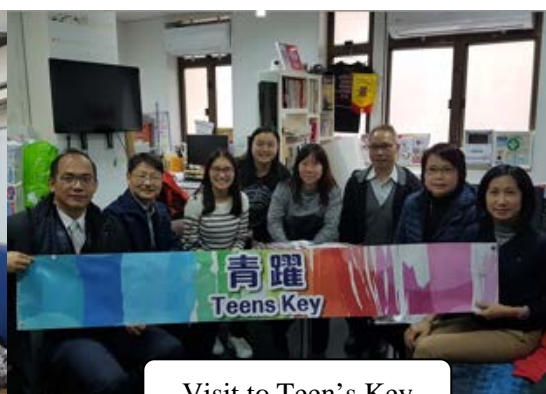
Visit to Teen's Key