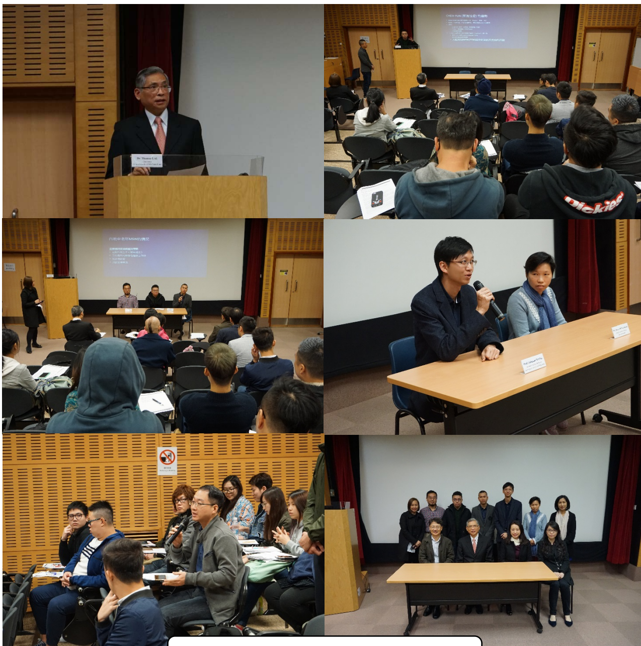
ATF Sharing Session on 5 December 2017

A sharing session was held on 5 December 2017. The session served as a platform for grantees to share their experience on HIV prevention and control in priority communities, as well as AIDS-related research through their programmes supported by the Fund.