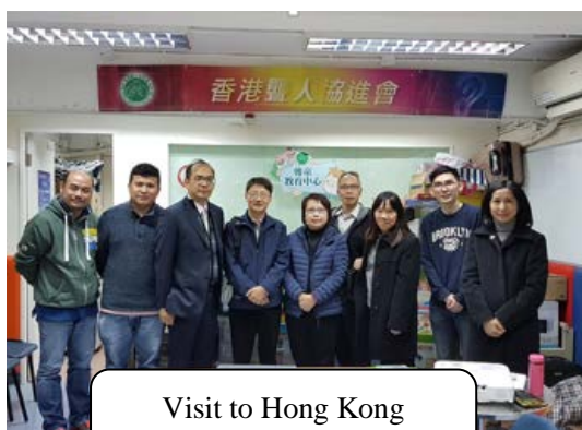
Visit to Hong Kong Association of the Deaf