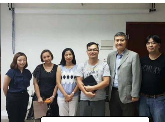
Visit to Gathering Point