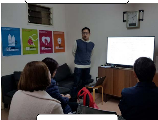
Visit to A-Backup