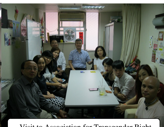
Visit to Association for Transgender Right