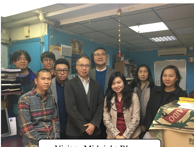
Visit to Midnight Blue