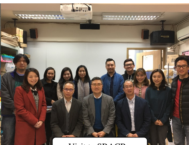
Visit to SRACP