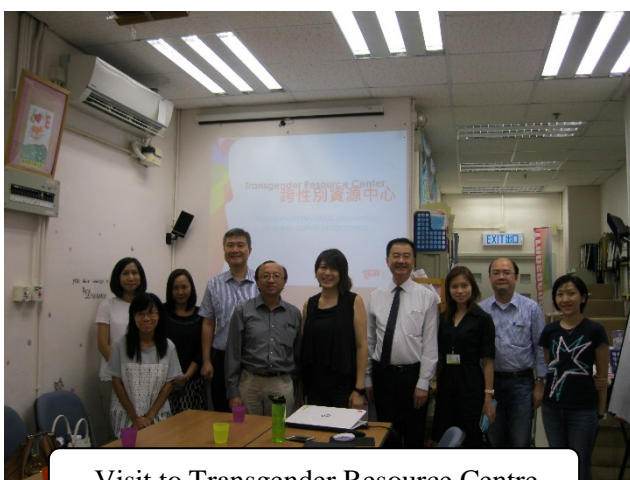
Visit to Transgender Resource Centre