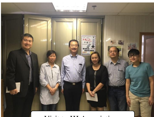
Visit to JJJ Association