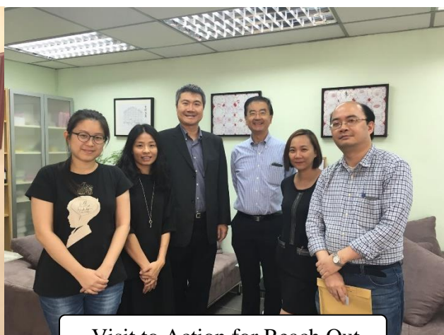
Visit to Action for Reach Out