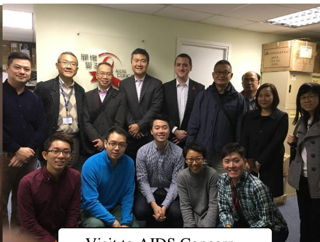
Visit to AIDS Concern