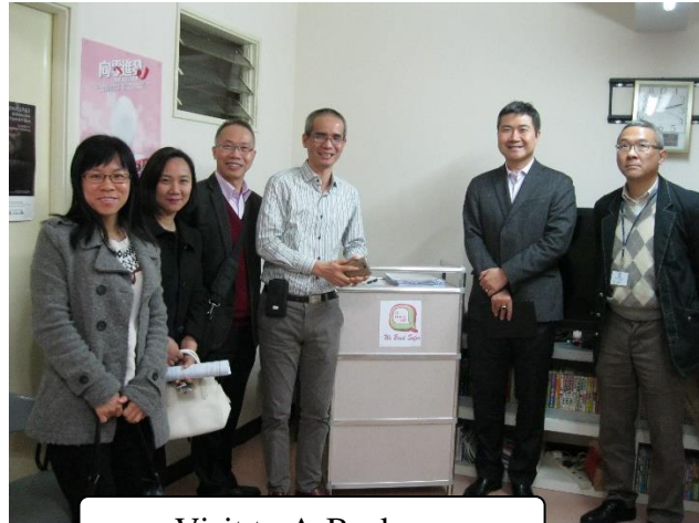
Visit to A-Backup