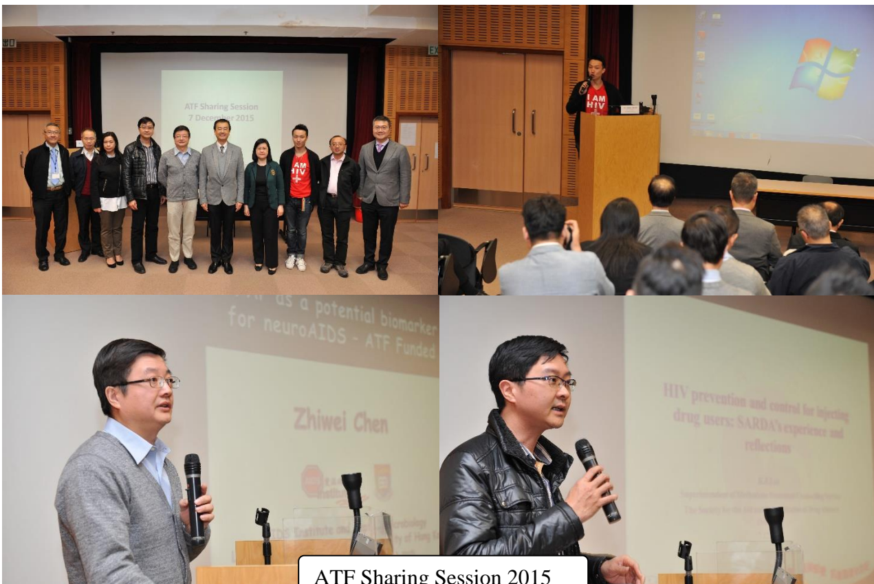
ATF Sharing Session 2015

Over 40 participants from different NGOs, Universities, the Council and ACA attended the sharing session.